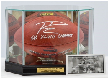
A Piece of Seahawk History! Signed Russell Wilson Football with an inscription that reads: SB XLVIII Champs