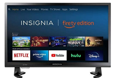
32" Smart HD TV -- Fire TV Edition

Dinner for 8 at Chemo's Mexican Restaurant